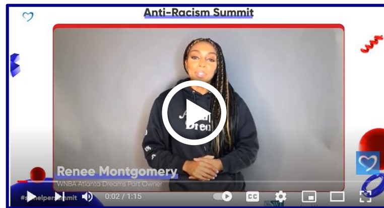
Anti-Racism Virtual Summit October 26th and 27th